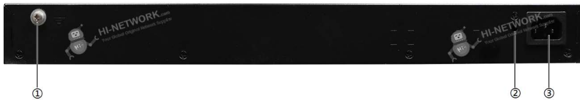
Figure 3 shows the back view of S5735-L48P4S-A1.